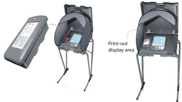
The voter verifiable unit easily fits into the eSlate booth.

Hart InterCivic's commitment to integrity, our industry, and our customers, has led us to provide a Voter Verifiable Paper Audit Trail (VVPAT) version of our eSlate™ Electronic Voting System for those jurisdictions affected by VVPAT legislation or regulations.